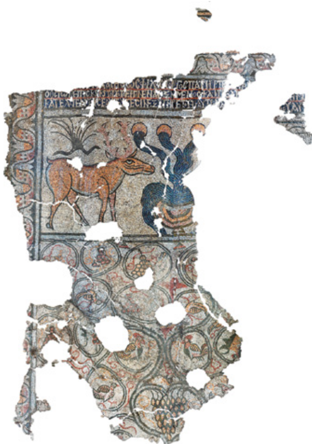
Сл. 2 Мозаичниот под од североисточниот анекс.