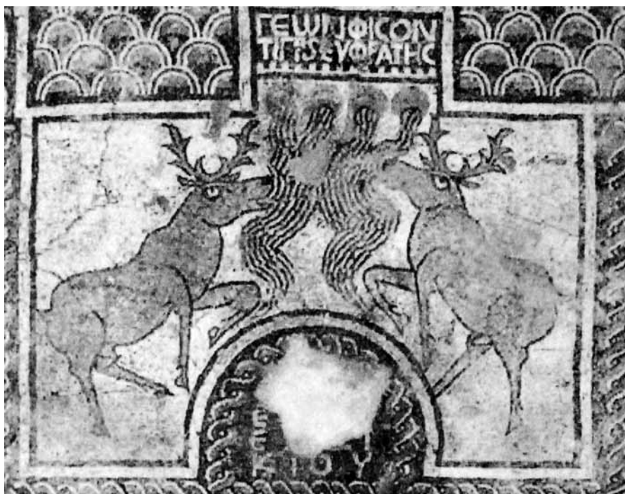
Сл. 5 Мозаик во северниот анекс на базилика Д, Билис. Според S. MUÇAJ, M. P. RAYNAUD, op. cit. , fig. 4a.

Fig.4 Mosaic in the apse of the north-west annex.