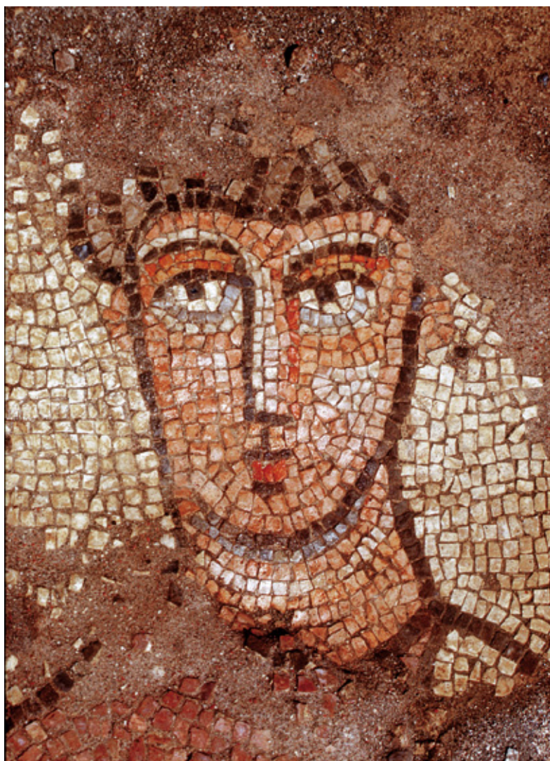
Сл. 9 Мозаик со претстава на човечка фигура од презвитериумот на базиликата Ц во Билис.

Fig.9 Mosaic with a representation of a human figure in the presbytery of the basilica C in Byllis.