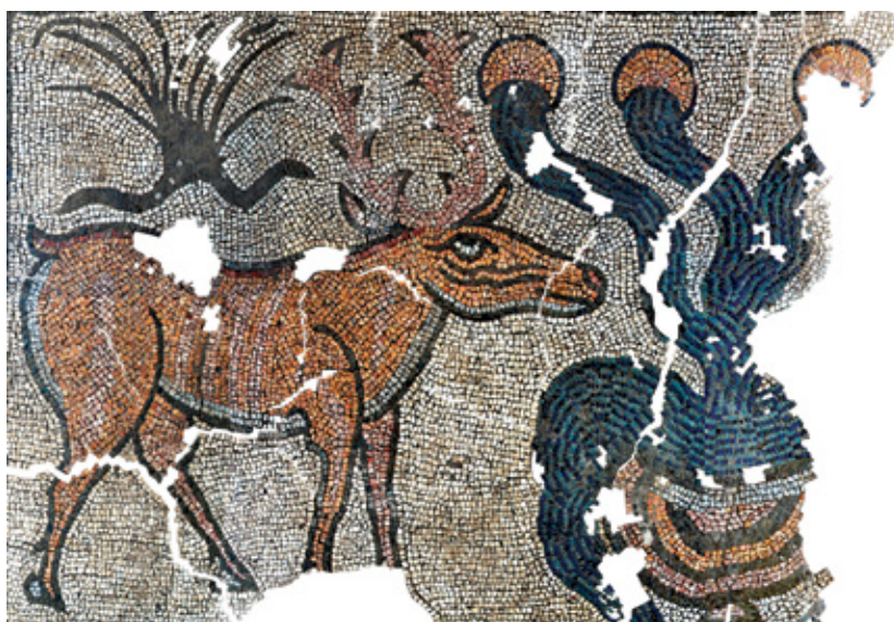
Сл. 3 Мозаик од североисточниот анекс, детаљ.

Besides the newly discovered mosaic in the north-east annex, further conservation and restoration activities based on previous studies lead to a discov-