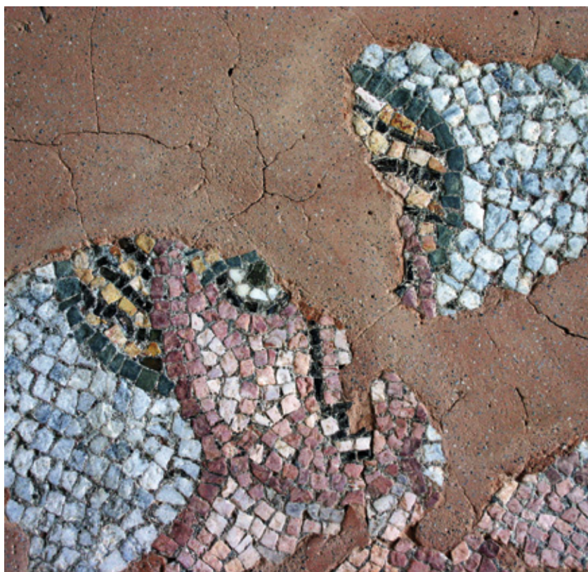
Сл. 8 Споени мозаични фрагменти со претстава на човечка фигура – детал. Fig.8 Joined mosaic fragments with a representation of a human figure – detail.