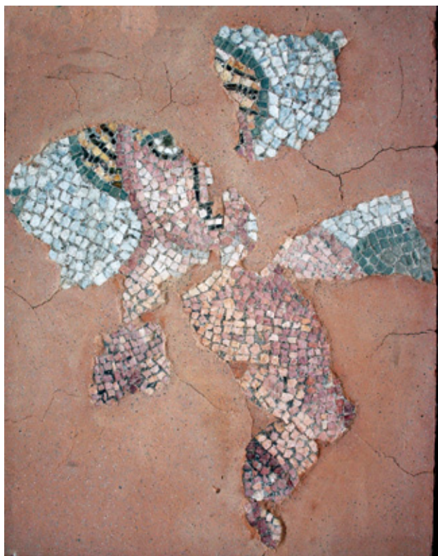
Сл. 7 Споени мозаични фрагменти со претстава на човечка фигура. Fig.7 Joined mosaic fragments with a representation of a human figure.