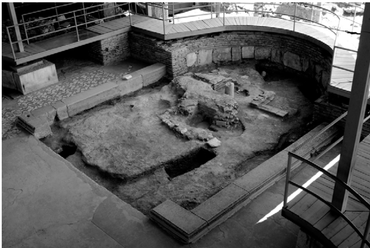
Сл. 10 Изглед на презвитериумот од Тетраконхалната црква на Плаошник. Fig.10 The presbytery of the Tetraconchal church at Plaošnik.

sixth century, a period marked with peace and prosperity throughout the Empire under the reigns of Anastasius I (491-518) and Justin I (518-527). Upon completion of their commitment in Ohrid, the mosaic workshop transferred its operations to Byllis where its masters executed the mosaic decoration in the basilicas A, B, C and D.