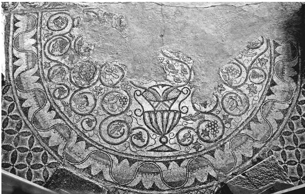
Сл. 6 Мозаикот од западната конха на тетраконхалната црква. Fig.6 Mosaic of the west conch of the Tetraconchal church.

es 11 . Later on, after several mosaic pavements have been discovered in few basilicas in Byllis (A, B, C and D), a number of visual motifs, bordures and compositional matrixes have been recorded as identical to the mosaics in the Ohrid Tetraconchal church. Scholars S. Muchaj and M. Raynaud point to the stylistic features that relate the mosaics from Ohrid and Byllis and based on all findings and analogies they assume that the workshop that operated in Ohrid, later created most of the mosaics in the Byllis churches 12 . The discovery of the human figure and particularly of the mosaic from the northeast annex, confirm the earlier assumptions and allows us to claim with certainty that the mosaics at both Ohrid and Byllis were carried out by the same workshop 13 .