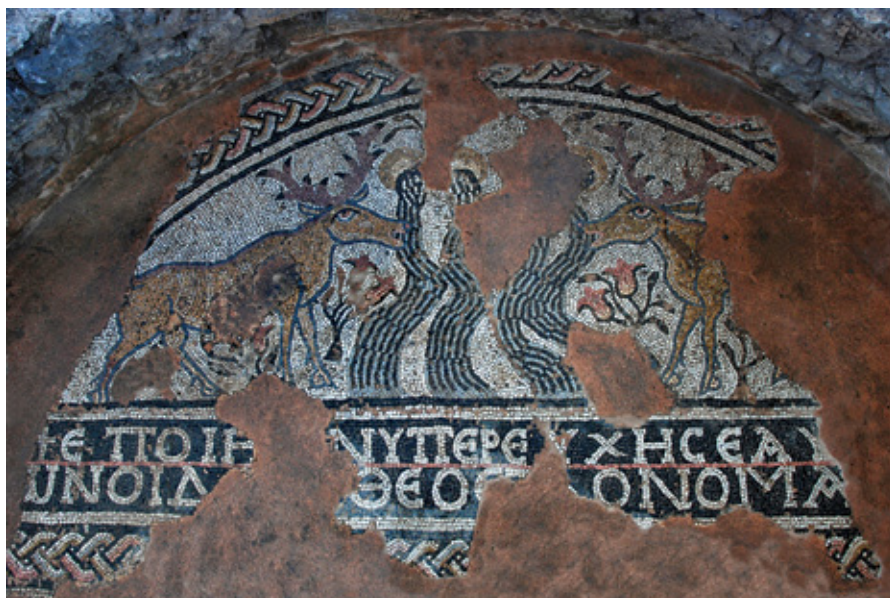
Сл. 4 Мозаик во апсидата на северозападниот анекс.

Fig.4 Mosaic in the apse of the north-west annex.